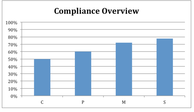
Figure 2: Compliance Overview Results

In Figure 2, the compliance overview of each of the characteristics is depicted, for the assessed case. The Civil Engineering Institution already has a high degree of security and also a high degree of maintainability, which means that the DamMangement system is highly maintainable and secure. Regarding compatibility and portability, the results are lower which might mean that system might not be prepared to be ported into a future environment and that it has not been tested with different components to check for compatibility issues. In Figure 3, we can depict the detailed results for each of the subcharacteristics of preservability. The sub characteristics are now described in increasing detail.